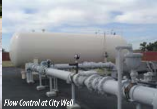
Flow Control at City Well