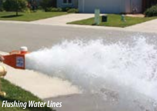
Flushing Water Lines