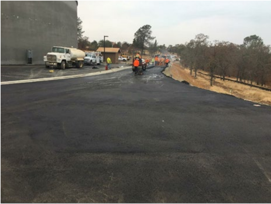
Paving operations along Tank #3 and sampling building.

Sewer Hot Spots Repairs: The contractor has completed all sewer rehabilitation locations and is currently working on completing the remaining punch list items. The project is anticipated to go before City Council early December.