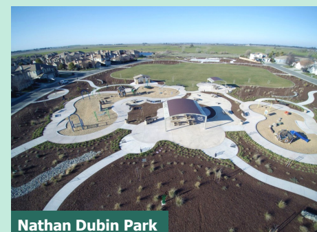
Nathan Dubin Park