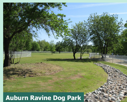
Auburn Ravine Dog Park