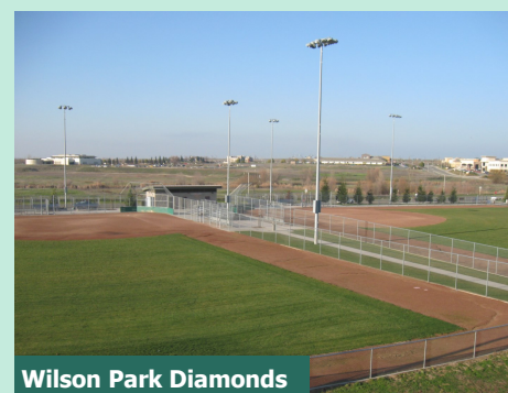
Wilson Park Diamonds